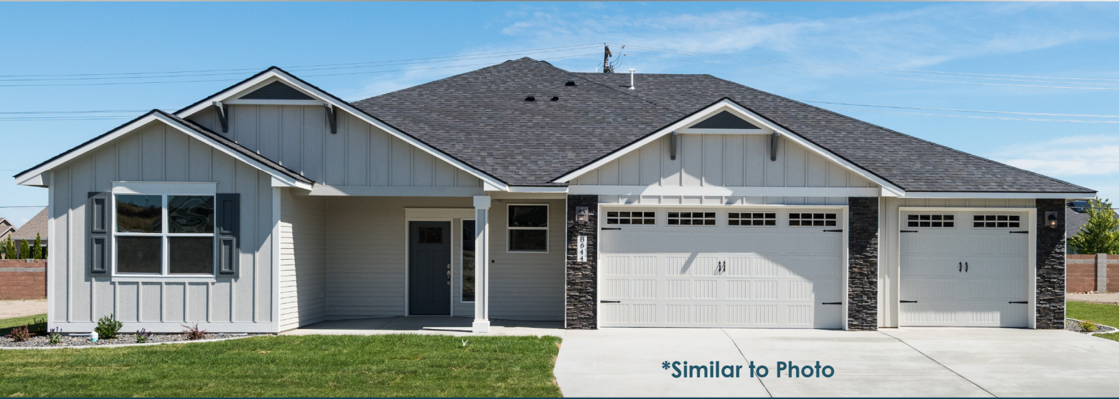
*Similar to Photo